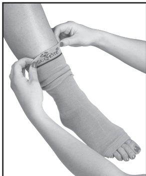
SecureSleeves ™ For Legs