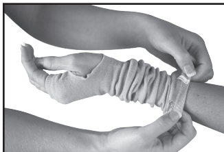
SecureSleeves ™ For Arms

Please see our complete line of Secure ® fall & wandering prevention products at www.padalarm.com .